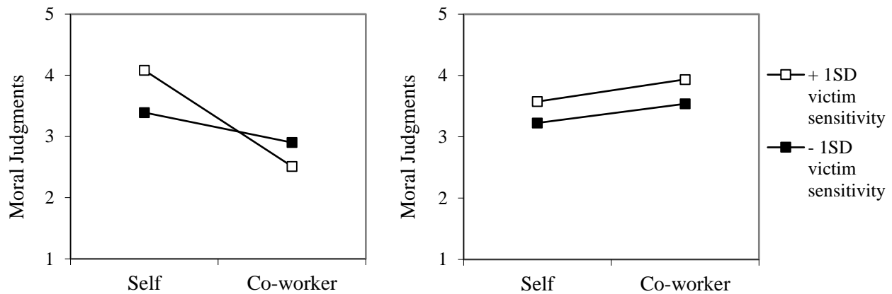
Figure 3. Moral judgments as a function of target condition and victim sensitivity in the distrust (left panel) and trust (right panel) conditions (Study 4). Participants' mean moral judgments of the imagined moral transgressions either committed by themselves or committed by their co-worker at \pm 1 standard deviation of victim sensitivity in the distrust (left panel) and trust (right panel) conditions. Higher values indicate more lenient moral judgments (scale 1-9).

victim-sensitive participants, that is, individuals who are highly motivated to avoid exploitation. In contrast, when trusting another person, victim sensitivity did not predict moral hypocrisy. In line with our reasoning, these findings suggest that people may utilize hypocritical moral judgments to counteract the threat of exploitation when perceiving the need to protect themselves under conditions of distrust.